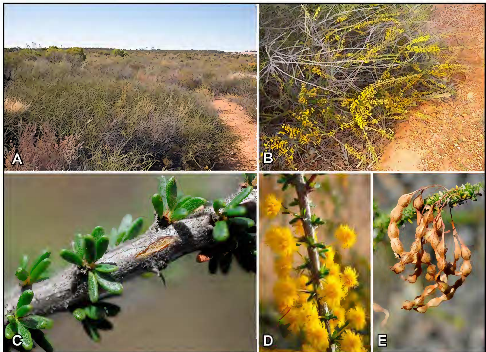
Figure 3. Acacia kulinensis. A – habit (foreground plant) and habitat; B – habit showing sparsely divided terminal branches; C – portion of branchlet showing fasciculate, small phyllodes and recurved, spiny stipules; D – flowering branch showing bright golden heads; E – pods.